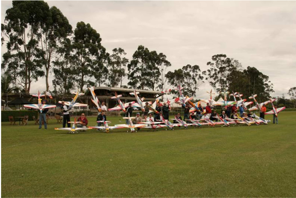
2010 championship pilots

The Venue: Medellín - Rionegro, Colombia: Medellín (Spanish pronunciation: [meðe'jin]), officially the Municipio de Medellín (Spanish) or Municipality of Medellín , is the second largest city in Colombia. It is in the Aburrá Valley, one of the more northerly of the Andes in South America. To 2012, it has a population of 2.7 million. With its surrounding area, the metropolitan area of Medellín ( área metropolitana de Medellín ), composed by another nine cities, it is the second largest urban agglomeration in Colombia in terms of population and economy, with more than 3.5 million people. The main airport serving Medellín (Jose Maria Cordova International Airport) is located at Rionegro. Rionegro is a city 30 kms from Medellín by car, and municipality in Antioquia Department, located in the sub region of Eastern Antioquia. The official name of the City is "Ciudad Santiago de Arma de Rionegro" but is named after the Negro River which is the most prominent geographical feature of the municipality. Rionegro is also sometimes called the Cuna de la democracia (Cradle of democracy) as it was one of the most important cities during the era of the Colombia's struggle for independence and the 1863 constitution was written in the city.